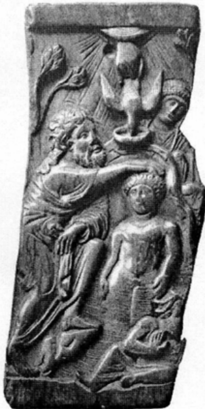
Baptism of Christ, 6th century ivory panel from northern Italy

"Through this union with Christ in Baptism, we receive both the forgiveness of sins and new birth through the Holy Spirit."