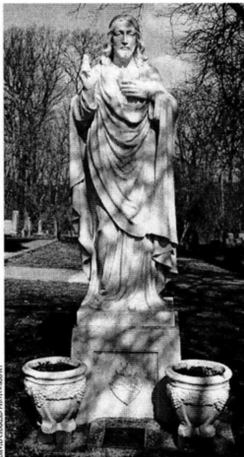
The Sacred Heart of Jesus, full of endless mercy

"The Lord's desire to save us is so strong that it extends even past the grave."