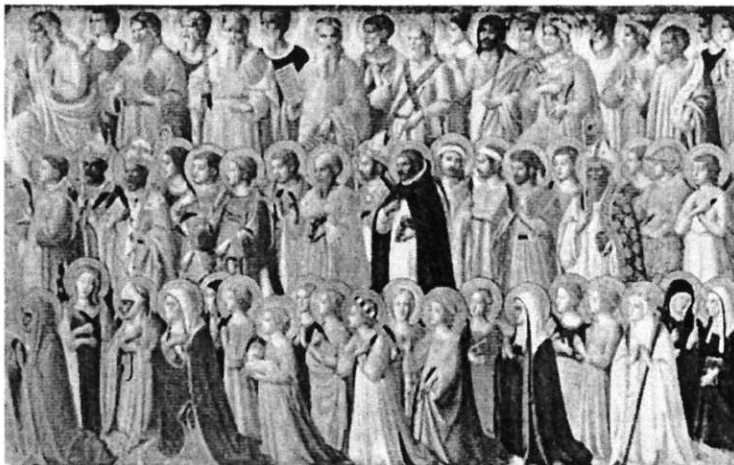
Saints from Predella, detail of the Madonna of Sandomenico, by Fra Angelico, 1387-1455

And Mary said, "My soul magnifies the Lord, and my spirit rejoices in God my Savior, for he has regarded the low estate of his handmaiden. For behold, henceforth all generations will call me blessed; for he who is mighty has done great things for me, and holy is his name. And his mercy is on those who fear him from generation to generation. He has shown strength with his arm, he has scattered the proud in the imagination of their hearts, he has put down the mighty from their thrones, and exalted those of low degree; he has filled the hungry with good things, and the rich